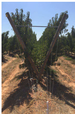
Picture 2: 3-years-old nectarine 'Autumn Bright' trained as Tatura Trellis