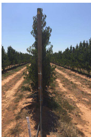
Picture 1: 3-years-old peach 'August Flame' trained as Vertical Axis

Understanding the effects of canopy architecture and crop load on non-structural carbohydrate (NSC) in stonefruit trees is fundamental to boost early bearing and ensure consistent fruit size and quality. NSC, like sucrose or starch, is an important energy store in plants as well as an indicator of potential plant productivity. NSC is critical as a source of reserves for the growth/development and play an important role in tree carbohydrate dynamics, under conditions of excessive sink demand (high crop load) and when carbon acquisition is reduced by biotic and/or abiotic stress (e.g. nutrient, drought stress). There is limited knowledge on the effects of crop load on NSC accumulation in peach as influenced by canopy architecture.